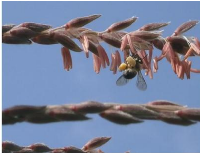
Figure-2. Apis mellifera collecting pollen in a panicle of Zea mays (Dounia, May 21, 2016)