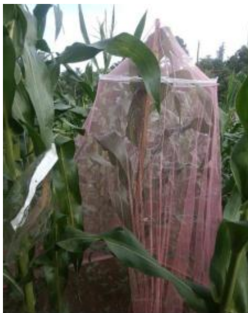
Figure- 1. Plant of Zea mays isolated from insects (Dounia, May 30, 2017)

IMP : isolated maize plant ; CCF : corn cob formed