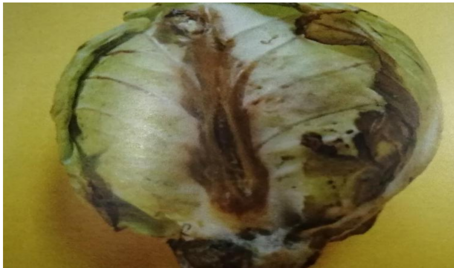
Figure-4. Black rot in cabbage due to Xcc artificial inoculation.

The bacterium infiltrated in to cabbage leaves produced typical blackening of leaf veins on 6 th day and the infected area turned papery whitish within next 3 days. The bacterium infiltrated in to cabbage head caused typical blackening and rotting of inoculated area within 6 to 7 days and the entire cabbage head got rotten within 10-15 days under in vitro condition Figure 4 . The rotten portion emitted foul smell.