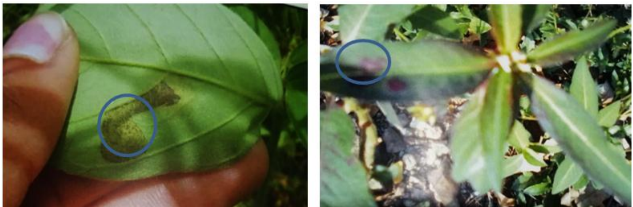
Figure-5. Reaction of Xcc on weed Cassia tora and Euphorbia geniculata

The survival and presence of bacterium in the infiltrated areas showing no visible reaction, browning hypersensitive reaction, yellowing reaction or greyish reaction studied up to 60 days by making isolation from the infiltrated areas revealed that the weeds which showed BR and YR Figure 5 had the presence of the bacterium Xcc up to 15 days indicating that the bacterium can survive in these weeds up to 15 days.