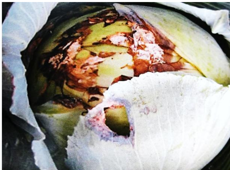
Figure-1. Natural infection of black rot disease in cabbage.

Black rot disease infected samples of cabbage Figure 1 were collected from the Nashik district which grows the cabbage crop extensively in Maharashtra state, India.