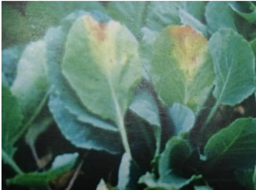
Figure-3. Pathogenicity of Xcc on cabbage seedlings.