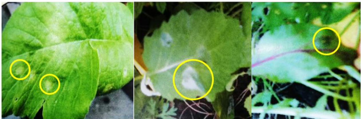
Figure-6. Reaction of Xcc on Radish, on Mustard and on beet leaf respectively.

Different cole crop leaves viz. of cabbage, radish, carrot, beet and mustard inoculated with Xcc produced either Hypersensitive reaction (HR) or Susceptible water soaked reaction SR Figure 6. Only the cabbage leaves produced SR with blackening of the leaf vein on 6 th day whereas other cole crop leaves produced HR of different types. The production of HR varied according to the sensitivity of crop to the inoculated Xcc bacterium. The mustard leaves were very sensitive to the bacterium and produced HR within 24 hrs followed by beet leaves which required 48 hrs for production of HR followed by radish and carrot which required 72 hrs for HR production Table 3. The HR reaction was either brownish area, Yellowish area, papery white area, greening area.