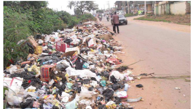
Figure-3. Another heap of complex municipal solid waste on the roadside of Abuja-Keffi Express way around Sharp Corner at Source: Butu et al. (2013).

Dump sites or waste bins are nonexistent and where dumps are sited overflow with refuse, the open solid waste dumps ooze out offensive odour, constituting health hazards. Also, some people do not have access to a toilet. They defecate in the open, exposing themselves and others to fecal bacteria.