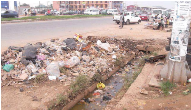
Figure-2. A heap of Complex municipal solid waste on the roadside of the popular Abacha road at Mararaba. Mararaba.

Government, 2008). Given that sanitation and waste management in developing countries and towns is an ongoing challenge due to weak institutions such as environmental laws, chronic under-funding, rapid urbanization, among others, the situation in Nasarawa State, Nigeria, is not different from other towns or cities in the developing world. Many towns especially the urban and semi-urban areas of high population density experience increasing volumes of waste generation and sanitation problems. In the absence of a regular and efficient solid waste collection system, waste is dumped in open spaces, on access roads and along water courses, which constitutes health hazard. In some parts of Nasarawa urban areas, there are no public facilities for disposing refuse within reasonable distance.