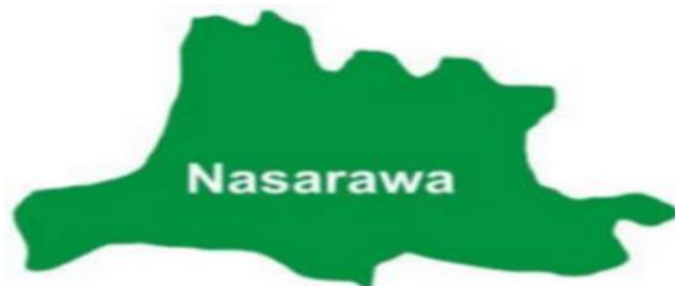
Figure-1. Nasarawa State, Nigeria