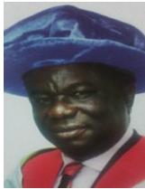
(✉) Corresponding Author