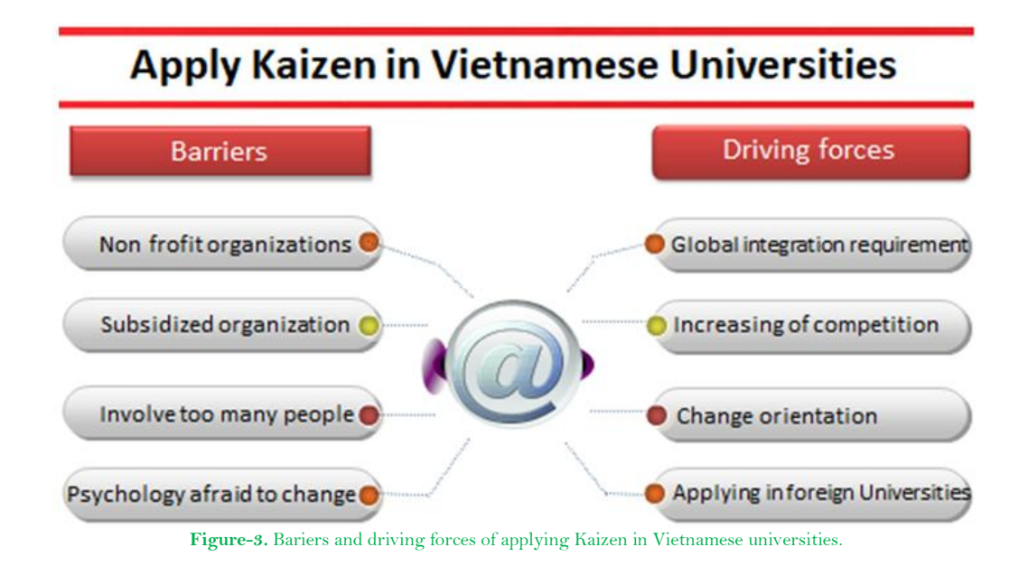
Figure 3 shows some main bariers and driving forces of applying Kaizen in Vietnamese universities.

Teian (1992) describes that Kaizen is more than just a means of improvement because it represent the daily struggles occurring in the workplace and the manner in which these struggles are overcome. Kaizen can be applied to any area in need of improvement.