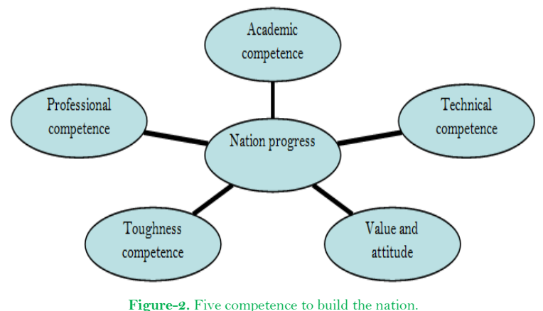
Figure-2. Five competence to build the natio

The resources needed to build the Indonesian nation, especially in this global era, as revealed by Kasiram (2008) there are at least five competencies that must be possessed, as in the following Figure 2: