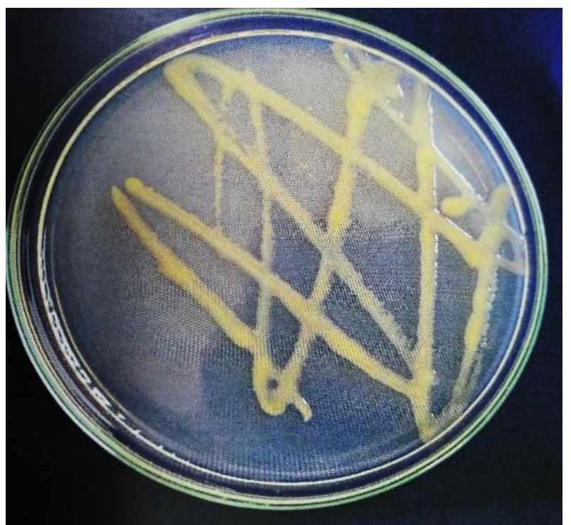
Figure-2. Pure culture of black rot bacterium Xcc in petriplate.

Bacterial colonies of Xcc having translucent, yellow, smooth, raised growth were further purified by dilution plating technique and the pure culture of black rot pathogen Figure 2 was used in pathogenicity test and other studies.