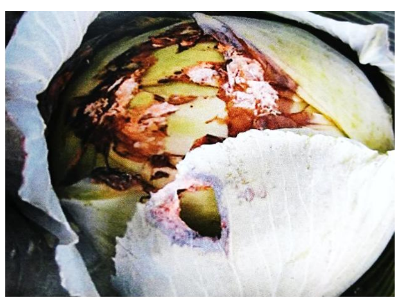
Figure-1. Natural infection of black rot disease in cabbage.

Black rot disease infected samples of cabbage Figure 1 were collected from the Nashik district which grows the cabbage crop extensively in Maharashtra state, India.