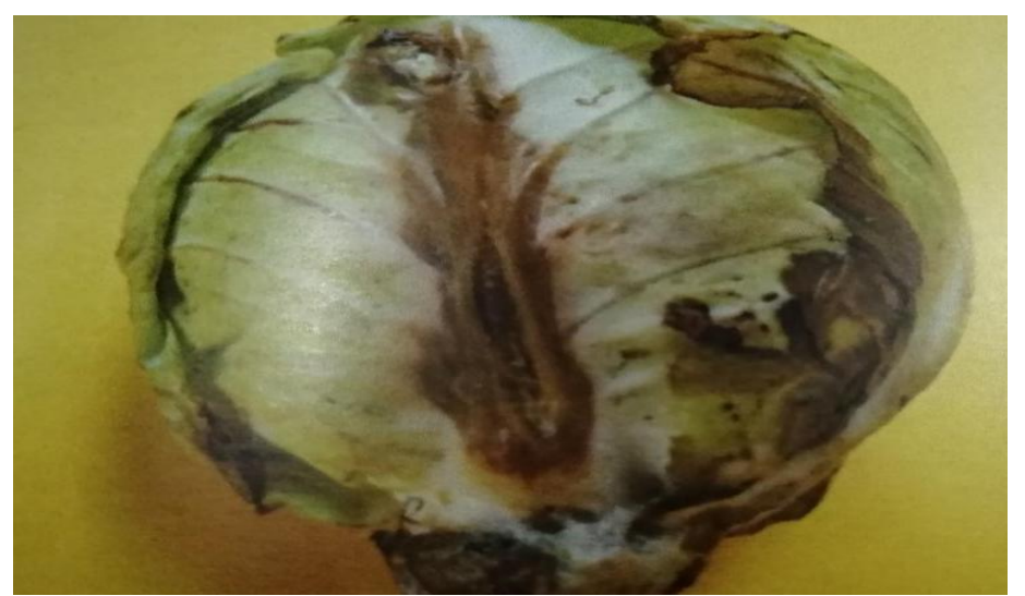
Figure-4. Black rot in cabbage due to Xcc artificial inoculation.

The bacterium infiltrated in to cabbage leaves produced typical blackening of leaf veins on 6<sup>th</sup> day and the infected area turned papery whitish within next 3 days. The bacterium infiltrated in to cabbage head caused typical blackening and rotting of inoculated area within 6 to 7 days and the entire cabbage head got rotten within 10-15 days under in vitro condition Figure 4. The rotten portion emitted foul smell.