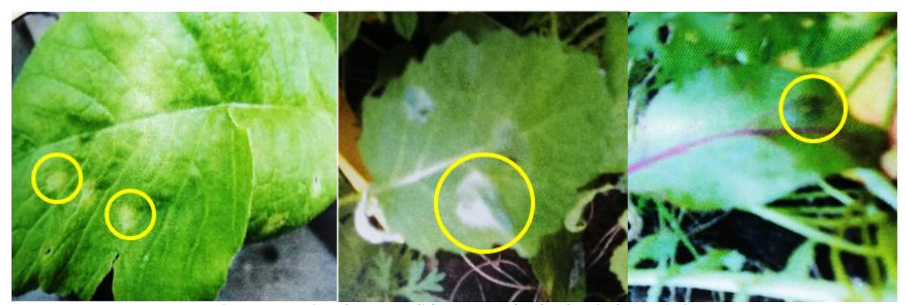
Figure-6. Reaction of Xcc on Radish, on Mustard and on beet leaf respectively

Different cole crop leaves viz. of cabbage, radish, carrot, beet and mustard inoculated with Xcc produced either Hypersensitive reaction (HR) or Susceptible water soaked reaction SR Figure 6. Only the cabbage leaves produced SR with blackening of the leaf vein on 6<sup>th</sup> day whereas other cole crop leaves produced HR of different types. The production of HR varied according to the sensitivity of crop to the inoculated Xcc bacterium. The mustard leaves were very sensitive to the bacterium and produced HR within 24 hrs followed by beet leaves which required 48 hrs for production of HR followed by radish and carrot which required 72 hrs for HR production Table 3. The HR reaction was either brownish area, Yellowish area, papery white area, greening area.