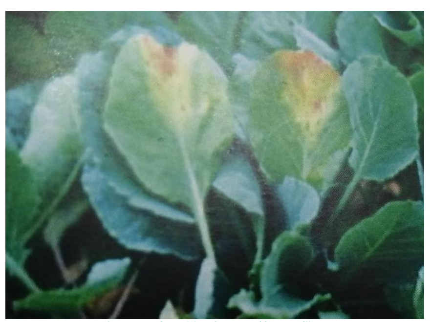
Figure-3. Pathogenicity of Xcc on cabbage seedlings.