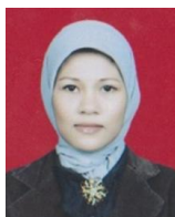
(✉ Corresponding Author)