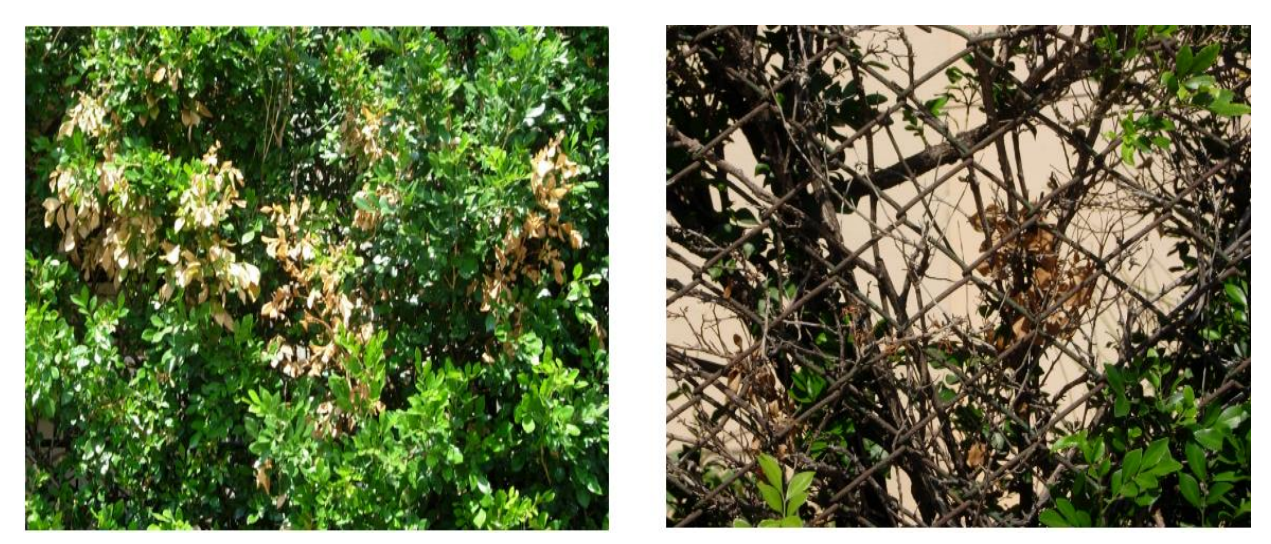
Figure 2. Murraya paniculata plants with symptoms of Lasiodiplodia pseudotheobromae. Left, blighted branches, right advanced wound.