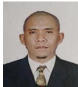
(✉) Corresponding Author