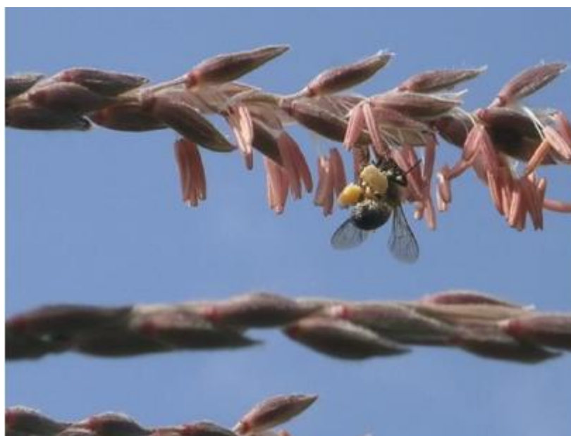
Figure-2. Apis mellifera collecting pollen in a panicle of Zea mays (Dounia, May 21, 2016)