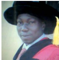
(© Corresponding Author)