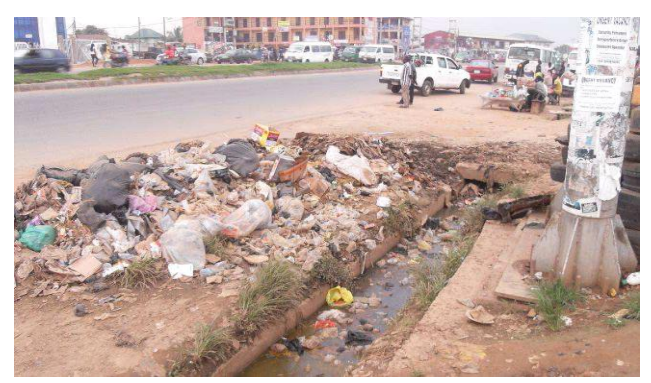
Figure-2. A heap of Complex municipal solid waste on the roadside of the popular Abacha road at Mararaba. Mararaba.

Government, 2008). Given that sanitation and waste management in developing countries and towns is an ongoing challenge due to weak institutions such as environmental laws, chronic under-funding, rapid urbanization, among others, the situation in Nasarawa State, Nigeria, is not different from other towns or cities in the developing world. Many towns especially the urban and semi-urban areas of high population density experience increasing volumes of waste generation and sanitation problems. In the absence of a regular and efficient solid waste collection system, waste is dumped in open spaces, on access roads and along water courses, which constitutes health hazard. In some parts of Nasarawa urban areas, there are no public facilities for disposing refuse within reasonable distance.