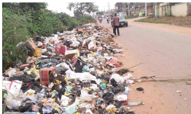
Figure-3. Another heap of complex municipal solid waste on the roadside of Abuja-Keffi Express way around Sharp Corner at

Dump sites or waste bins are nonexistent and where dumps are sited overflow with refuse, the open solid waste dumps ooze out offensive odour, constituting health hazards. Also, some people do not have access to a toilet. They defecate in the open, exposing themselves and others to fecal bacteria.